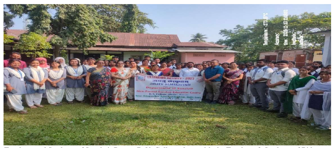
Teachers and Students of Sanskrit Deptt., B. N. College along with the Teachers & Students of Bidyapara Boys' Higher Secondary School